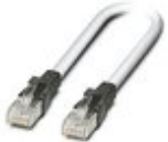
Patch cable, CAT5, assembled, 0.5 m

Patch cable - FL CAT5 PATCH 0,5 - 2832263